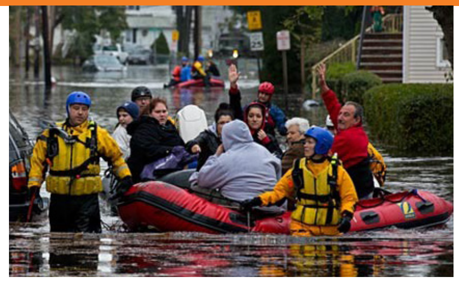
Boat rescue in Little Ferry.

http://www.cfnj.org http://jerseyshorepartnership.com