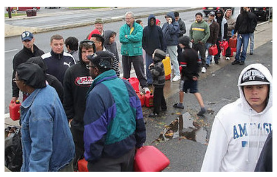
People in line for gas.